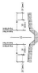
FIG. 1 - PROPOSED DEVELOPMENT 20' MANHOLE ALONG WITH SECTION

CONTRACTORS 10000 Highway 100 Suite 100 Houston, TX 77036 Phone: 281.465.1000 Fax: 281.465.1001 Email: info@contractors.com